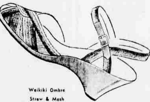
Waikiki Ombre Straw & Mesh