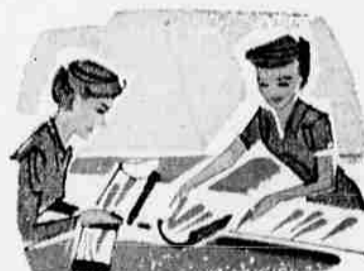
Speed counts in packaging. SNOBOY doesn't waste a second in packaging. Directly after washing and ice-water cooling, carrots—like other SNOBOY vegetables—are hand-packed . . . to be delivered to your store in perfect condition—fresh, crisp, flavorful!