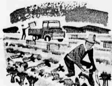
Speed counts at picking time. SNOBOY celery, for instance, must be at the absolute peak of flavor before SNOBOY inspectors say "pick." But once that time arrives, it's harvested in a hurry . . . to make sure all that famous SNOBOY "picked-for-flavor" quality reaches your table.