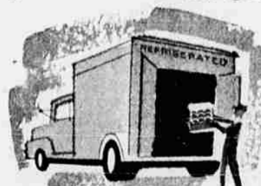
Speed counts in shipping. SNOBOY tomatoes, like all SNOBOY vegetables, are shipped in refrigerated trucks or railroad cars the same day they're picked. From field to store, speed makes the important SNOBOY difference in flavor . . . freshness . . . and crispness.