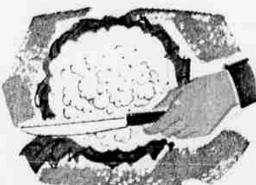
Speed counts in trimming. Vegetables, like this cauliflower, are hand-selected, then expertly hand-trimmed . . . no waste with SNOBOY! Not a moment is lost, no flavor escapes. For vegetables which are sized and graded, the same rule of thumb: do it fast!