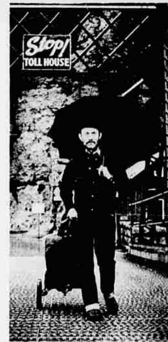
Despite rain, he pursues his course.