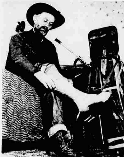
The pause that refreshes Carroll is a change of footwear.