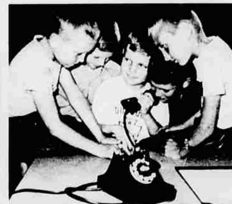
Back in Iowa, the boys take turns talking to their hero.