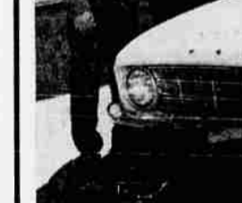
Shown here with the first Ford Falcon "Ranchero" pick-up to be delivered in Klamath Falls are, from left, Ed Zahler of Basin Refrigeration, Bill Ledbetter of Balsiger's, and Jerry Withers of Basin Refrigeration, a new partner in the firm, located at 2240 So. 6th St. The Falcon "Ranchero" is the newest in low cost, light duty, economical trucks by Ford.

NEW COMFORT Full size passenger cab with stretch out room and passenger seat comfort for three! NEW ECONOMY The 90 HP Falcon '60 gives you up to 30 miles per gallon... plenty of performance, too! LOADS OF SPACE Big 6' box (nearly 8' with tailgate down) provides over 31 cu. ft. of load space. Lower to foot, too!