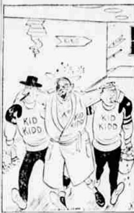
"Boy, oh boy! I wouldn't want to have HIS knuckles tonight!"