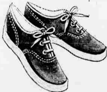
Children's and Misses TENNIS OXFORDS

High class upper and ridge design rubber sole. Built in arch with cushion insole.