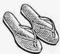
Children's & Ladies THONGS