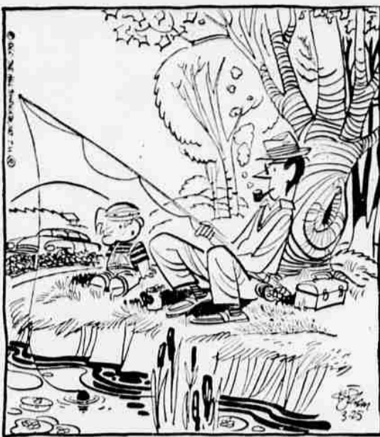
"I DON'T SEE WHAT FUN YOU GET OUTA DROWNING WORMS!"