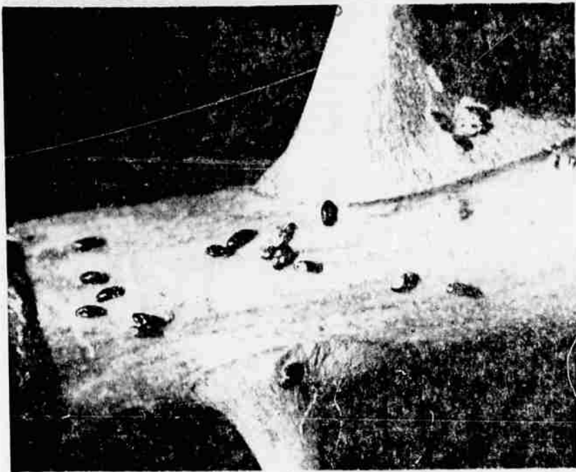
APHID EGGS laid by the common rose aphid on minute rose bush stems show overwintering forms of insect pests. Dormant sprays applied before leaf and flower buds open control such overwintering pests on fruit trees, shade trees, ornamental shrubs and rose bushes.