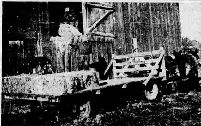
COOPERATION IS THE ANSWER when it comes to loading up the hay wagon for the morning run at the Kerns cattle ranch on the Keno Highway. Here Sydney boosts a bale out of the barn loft while her mother, Elaine, stands by to position it on the wagon. The dog, Sally, one of four shepherds on the place, was keeping a watchful eye on operations.