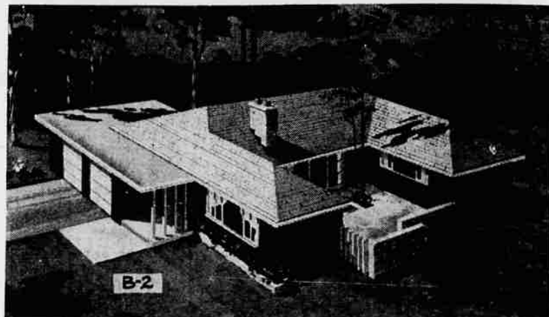
HORSESHOE RANCH: A different shape pays an outdoor living bonus in this six-room ranch design. The side patio is completely shielded on three sides by the house itself. Living room and foyer are across the front, kitchen and combination family-dining room at the base of the "U", and bedrooms in the rear.

The kitchen is the core of the home to the woman of the house. This one has room for all the mechanical labor savers that the homemaker could desire: built-in oven - broiler combinations, six burner counter-top range, built-in refrigerator, freezer, dishwasher and a generous amount of counter