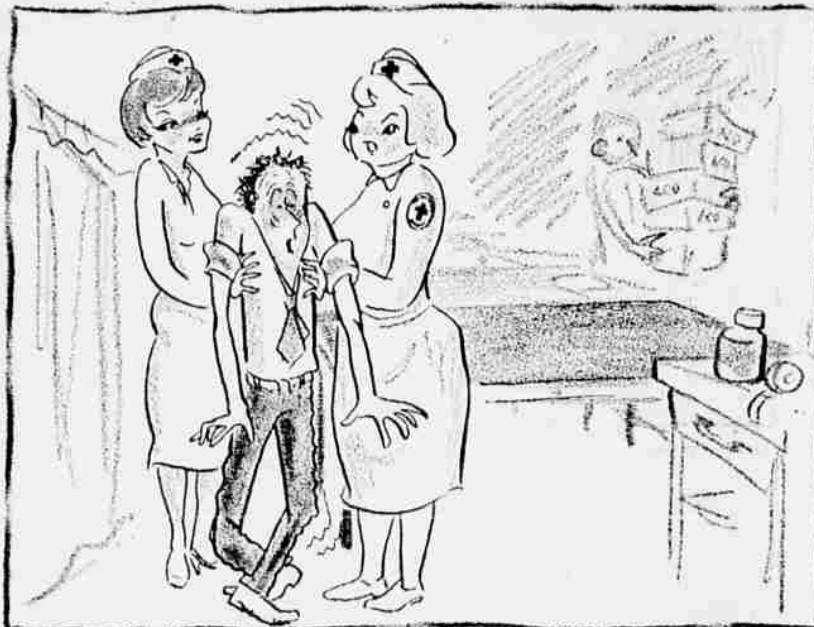
"THIS IS HIS FIRST DONATION. HE'LL FEEL JUST FINE AFTER HE GIVES"

Thanks to the success of this campaign, no fund raising activities will be conducted by the Red Cross in Klamath County during March, but the local chapter wishes to express its appreciation to its contributors and to report back to the public the scope and importance of the programs financed by the generous support of local residents.