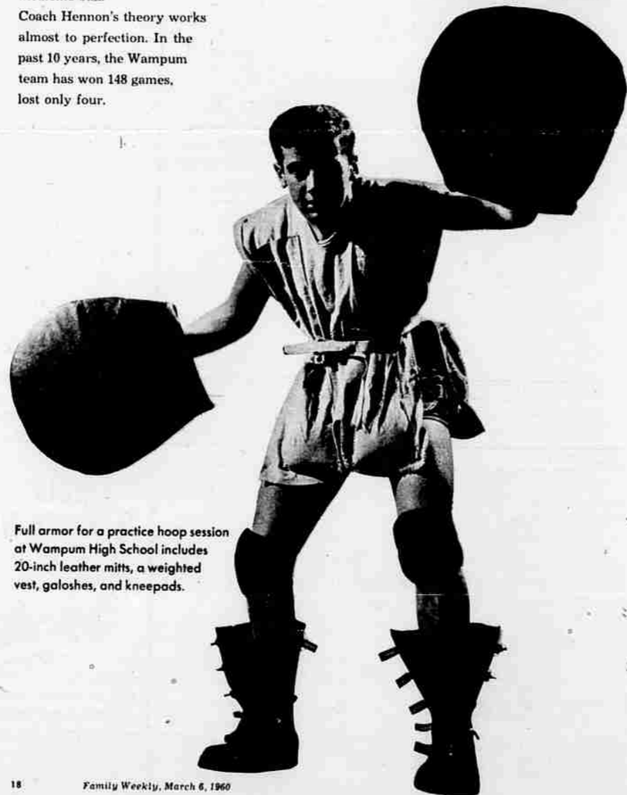
Full armor for a practice hoop session at Wampum High School includes 20-inch leather mitts, a weighted vest, galoshes, and kneepads.