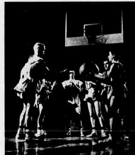
Passing heavy medicine ball develops skill in ball-handling as well as additional strength in wrists.