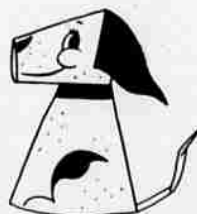
CORKERS Clarence Biers