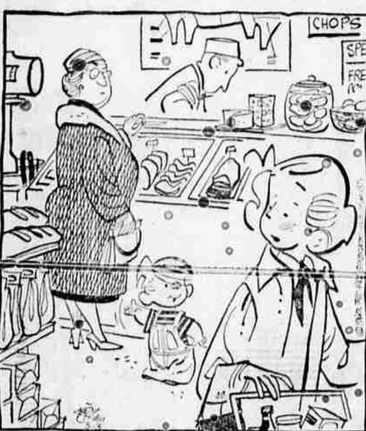
"PIG KNUCKLES" DID YA HEAR THAT SHE'S BUYIN' PIG KNUCKLES!