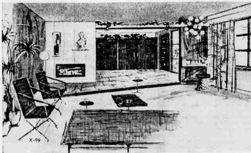
FANCY FOYER: Artist's view shows the unusual foyer arrangement, with angled edge of foyer forming raised hearth for fireplace.