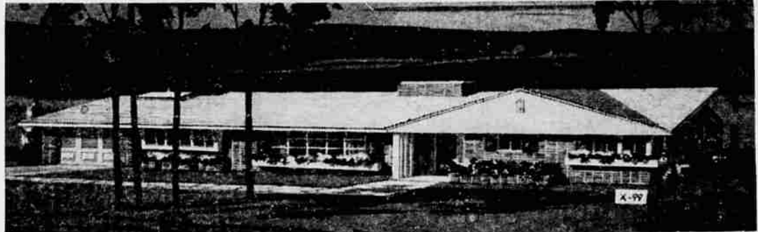
REGAL RANCH: This average-size three-bedroom ranch has far more than average glamor, convenience and comfort. There are two fireplaces and a sunken living room, large

garage and mudroom helps make this area a model of efficiency and convenience. Access is excellent from kitchen to garage, from kitchen to basement, from outdoors to