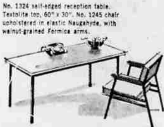
No. 1324 wall-edged reception table. Textolite top, 60" x 30". No. 1245 chair upholstered in elastic Naugahyde, with walnut-grained Formica arms.