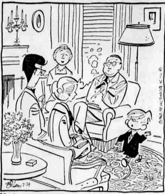
THAT'S FUNNY! EVERY ROOM BUT THIS ONE IS LOCKED!