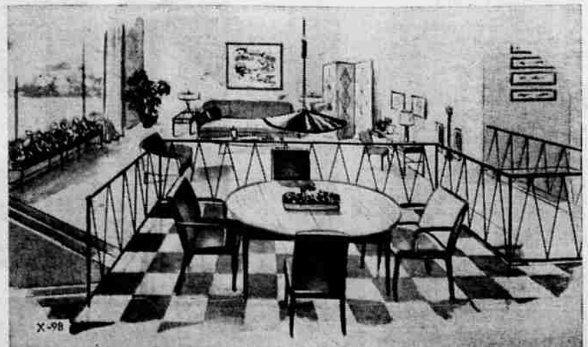
DRAMATIC DINING DAIS: Artist's view looks across dining area to dropped living room. Entrance foyer is on left and stairway to recreation room at the right. Part of bedroom balcony also is visible.