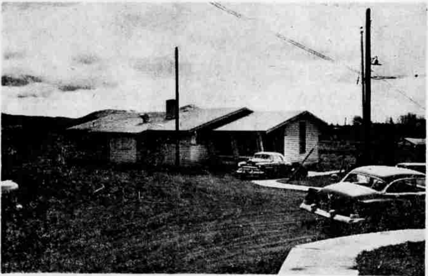
THIS BUILDING rented from Oregon Technical Institute was first home of Klamath Art Association and was used for three years. It was located in Mountain View Housing Project on Alameda Street. During World War II building was Marine Base Hospital, later used as personnel recreational center.