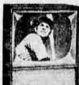
Model 1 - MV100L "American Traditional" 51" Mahogany Console $259.98