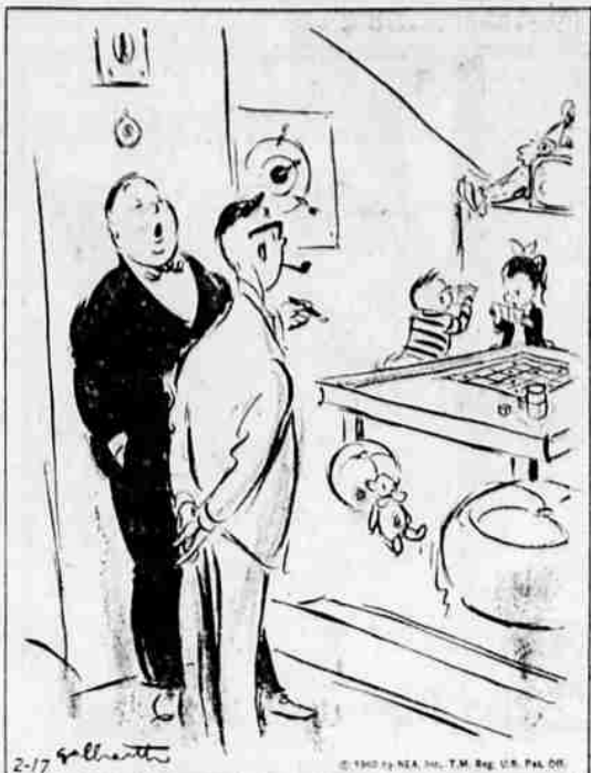
"It's a very educational game. Already the kids have learned how to cheat!"