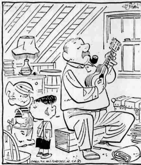
"It's called a uke, Joey. It's like a guitar that didn't grow up."