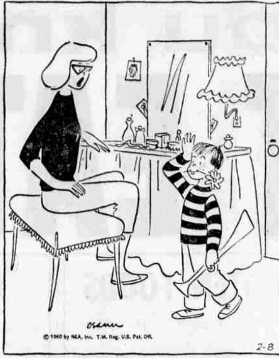
T.M. Reg. U.S. Pat. Off.