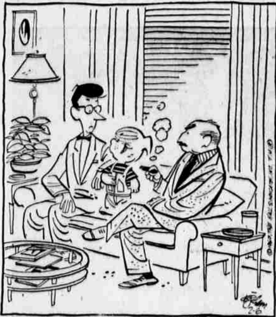
"I DON'T THINK HIS MOUTH IS SO BIG."