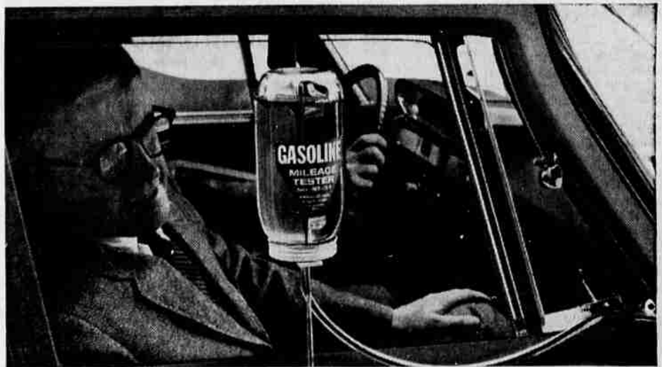
CLOSE-UP OF ECONOMY! Here's the PLYMOUTH PROVE-IT-YOURSELF ECONOMY METER in place. And when you take the test drive, note that brilliant performance is built into the Plymouth engines—including the new design 30-D Economy Six and the famed Plymouth Fury V-800.