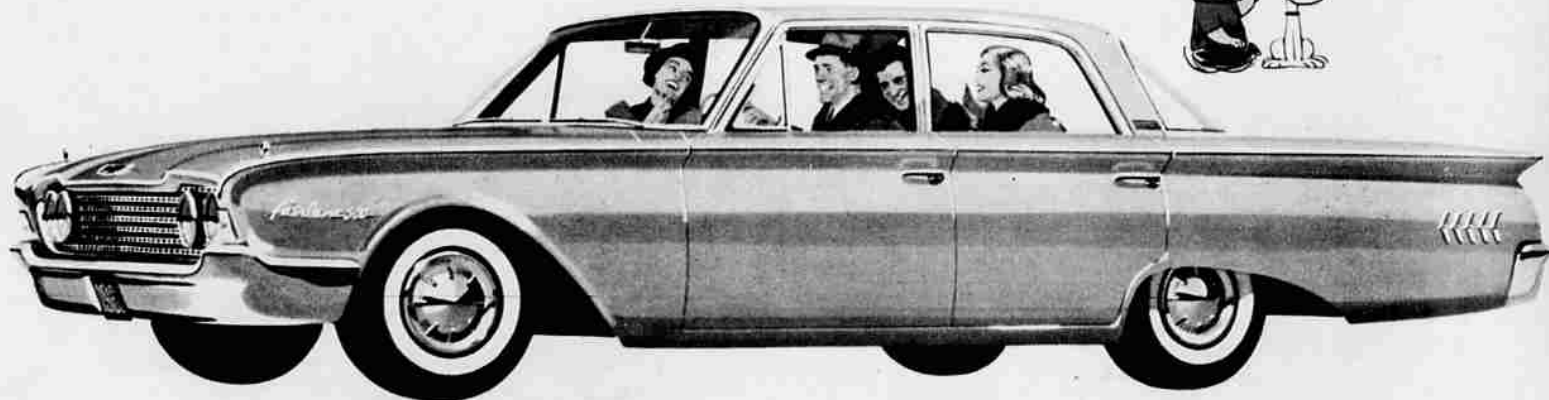
The big Economy Twin: Fairlane 500 Town Sedan