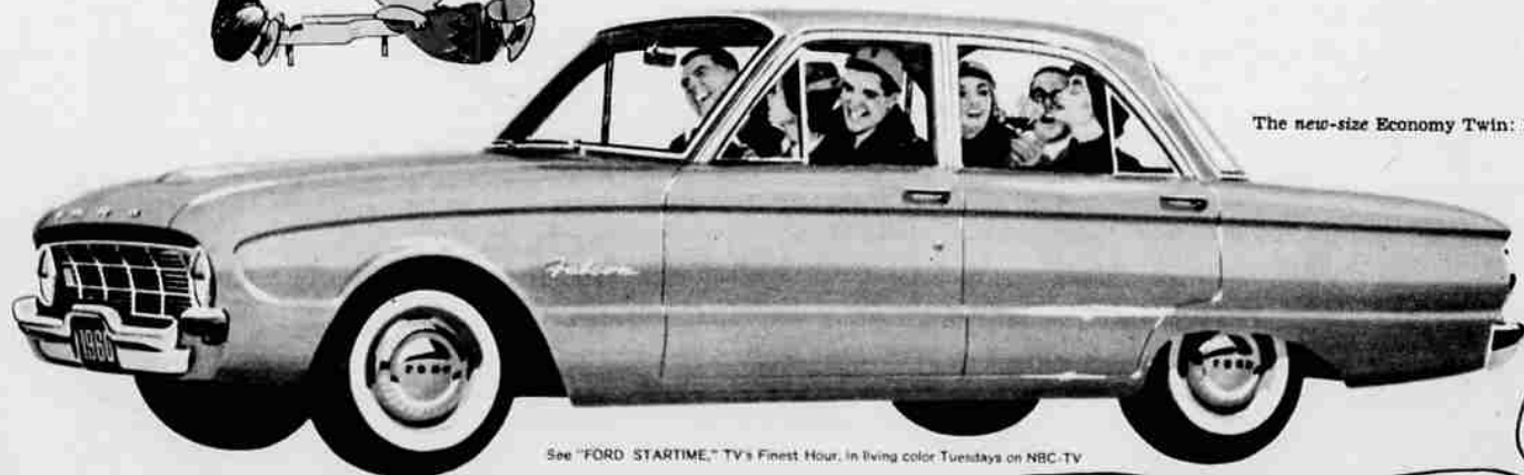
The new-size Economy Twin: Falcon Fordor Sedan

WHAT GOOD IS MONEY WITHOUT EMOTIONAL SECURITY?