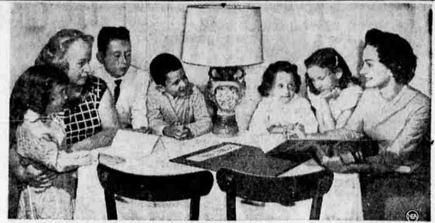
A CENSUS TAKER interviews a housewife in a test run for the 1960 Census of Population and Housing.

"Thus for the first time in census history, sensitive women don't have to dread answering that awful question out loud."