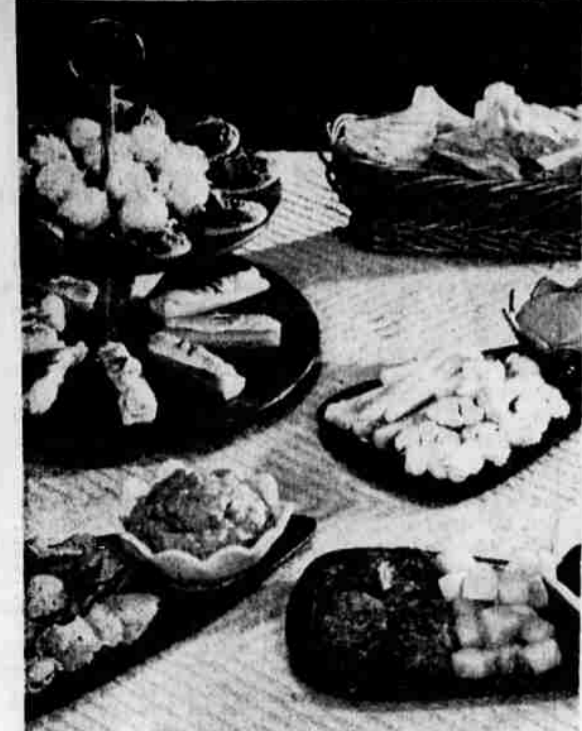
A BUFFET of snacks is ideal for indoor entertaining, especially if your home is small and your crowd is large. This photo and recipe suggestions are courtesy of the home economics department of H. J. Heinz Company, the "home of the 57 varieties."