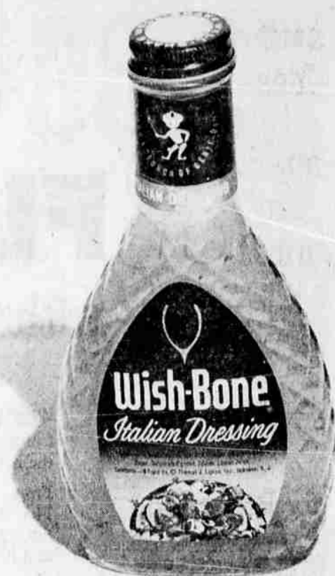
WISH-BONE dressings have come out in brand new dress and with a brand new offer from the Wish-Bone people which extends from now to April 30, 1960. Wish-Bone offers cash for trying its line of fine dressings.

The Wish-Bone people are offering a silver dollar for the return to them (Box 5490, St. Paul 4, Minn.) of a label from each of the four dressings, or 50 cents for three different Wish-Bone dressing labels, or 25 cents for two different Wish-Bone dressing labels. The offer expires on April 30 this year.