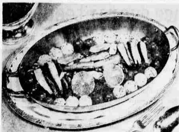
NORWAY SARDINES can be used in many ways in addition to topping for canapes. Here is a recipe for Norway Sardine Antiboise (and don't ask us to pronounce it). The photo shows the completed dish as prepared by a New York chef to serve four persons.