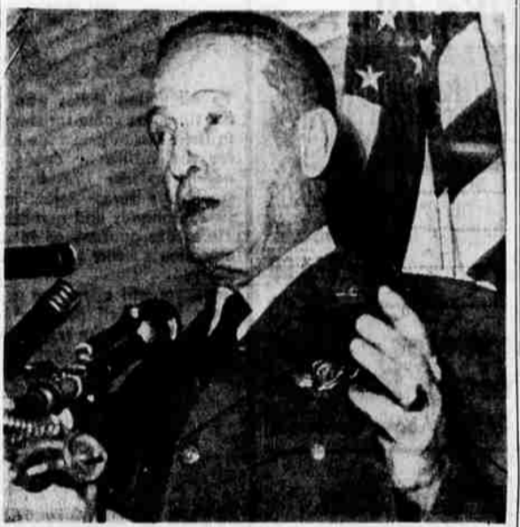
DESCRIBES NEW MISSILE —Gen. Thomas D. White, USAF chief of staff, addresses a National Press Club luncheon in Washington. Gen. White said the U. S. is developing a new ballistic missile called the "Skybolt" which will give this country an "essentially invulnerable" weapon against surprise attack. The missile will be carried in patrolling bombers and will have a range of 1000 miles.