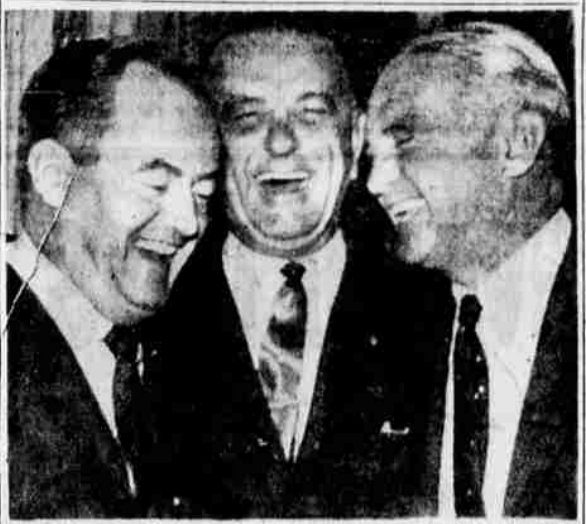
CANDIDATES —One "declared" and two "unavowed" candidates enjoy a hearty laugh prior to the opening of the second session of the 86th Congress in Washington, D. C. They are (left to right) Sen. Hubert Humphrey (Minn.), first to toss his hat in the ring; majority leader Sen. Lyndon Johnson (Tex.) and Sen. Stuart Symington (Mo.).