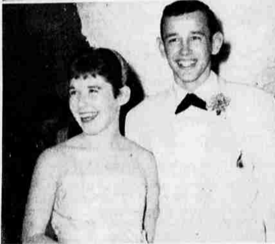
A QUEEN and her royal court of princesses were honored at the annual Sno-Ball presented on December 23 by the Klamath Falls Chapter of DeMolay at Reames Country Club. In a winter wonderland atmosphere of sparkle and