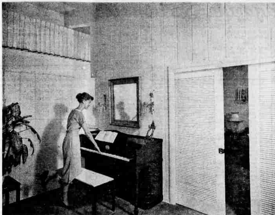
WOOD WALLS FOR PERFORMANCE — In a home of any architectural style, wood wall paneling makes a perfect, long-wearing backdrop for furnishings. Shown here is west coast hemlock, cut with a patterned joint. It has been painted white to compliment delicate antique appointments. Permanence and natural beauties of wood walls, whether painted or finished clear, add prestige and resale values to a home.