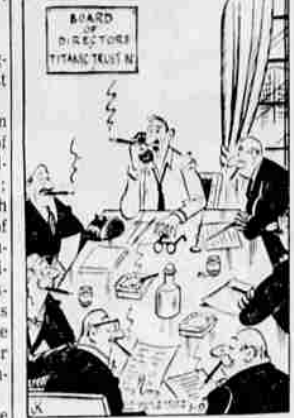
"J.B.: We've finally reached a decision... it's Fireflash in the first, Blueboy in the second, Whipalong in the third..."