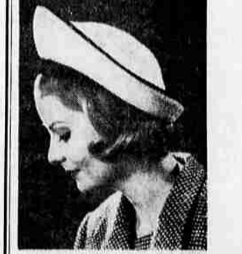
WHITE MILAN is stitched in this new sailor-baret by Irene of New York. The brim has the "upswept broton" feeling yet the bulk of a baret fills the crown.