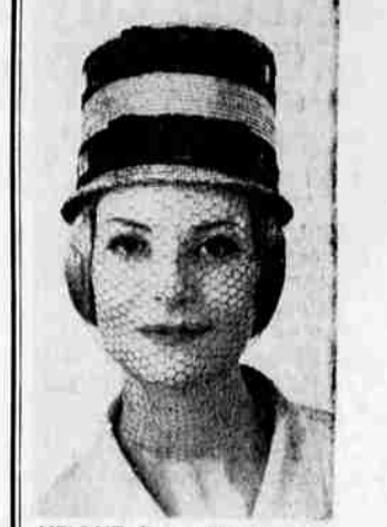
HEIGHT for spring is portrayed in this high crowned cloche by Chenda in burnt straw with two belts of black grosgrain. A black face veil completes the look of elegance.