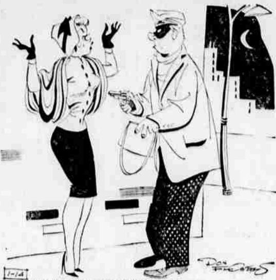
"This is deductible for me, but do YOU declare it?!"