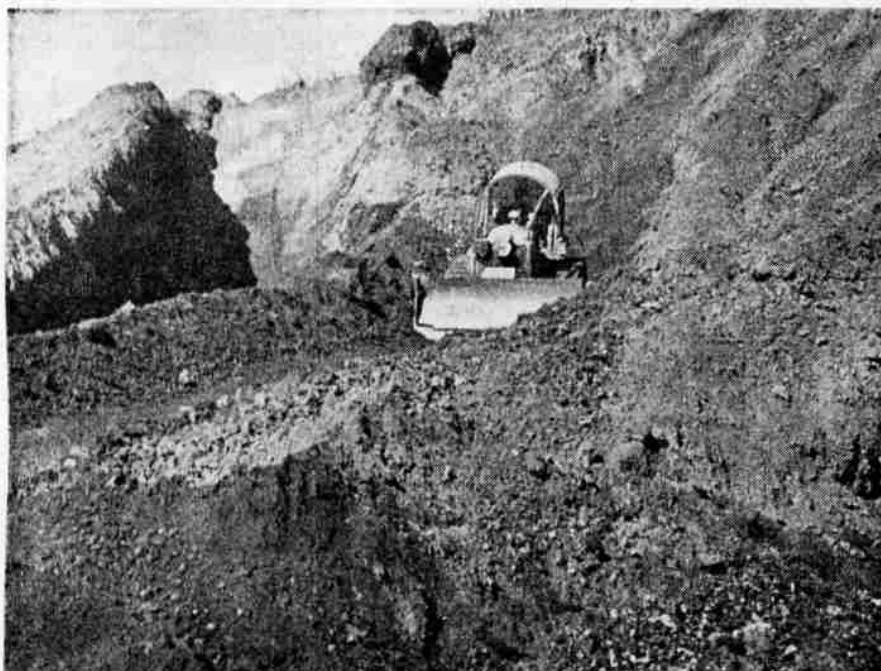
USING THE BULLDOZER above, assisted by another, the 26-yard capacity trucks are loaded in 90 seconds. The fast trucks are able to make a round trip in 18 minutes.