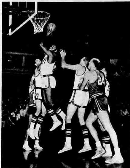
"Shorty" Elgin Baylor towers over bigger men in rebounding.

Zemo—the prescription-like formula—contains such ingredients to soothe irritated nerves that cause itching, quieting and cooling the skin . Zemo also eases pain of cuts, scratches, minor burns. Liquid or ointment; regular or extra strength. Save most, get large sizes of Zemo.