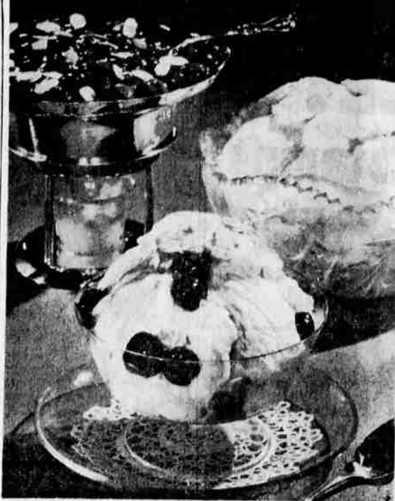
WHO SAYS that ice cream isn't a wintertime dessert? Here, America's favorite dessert goes dramatic as Cherry-Almond Jubilee. It's a gourmet dessert which can be prepared in a jiffy.

Have you served au gratin potatoes recently? Heat the milk before pouring over the casserole of slices raw potatoes, cheese and seasoning. It will cook more quickly and the sauce will stay creamier. Wonderful with ham.