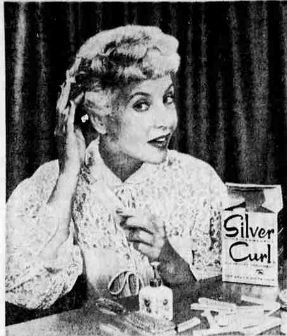
IF YOUR HAIR is touched with silver, this is your year to enjoy it. You're not only fashion's darling, you're the woman for whom Silver Curl, the special Toni home permanent wave for gray or partly-gray hair, was created.