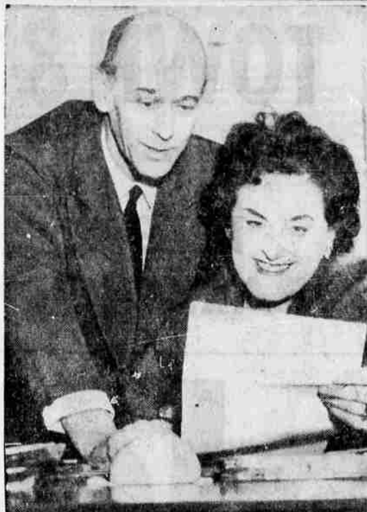
SIGNED, SEALED AND DELIVERED—Sweden's latest gift to the Metropolitan Opera in New York is shown as she signed a new contract. She's soprano Birgit Nilsson, who just made a sensational debut in "Tristan und Isolde." General manager Rudolph Bing was pleased to get her name on the line.