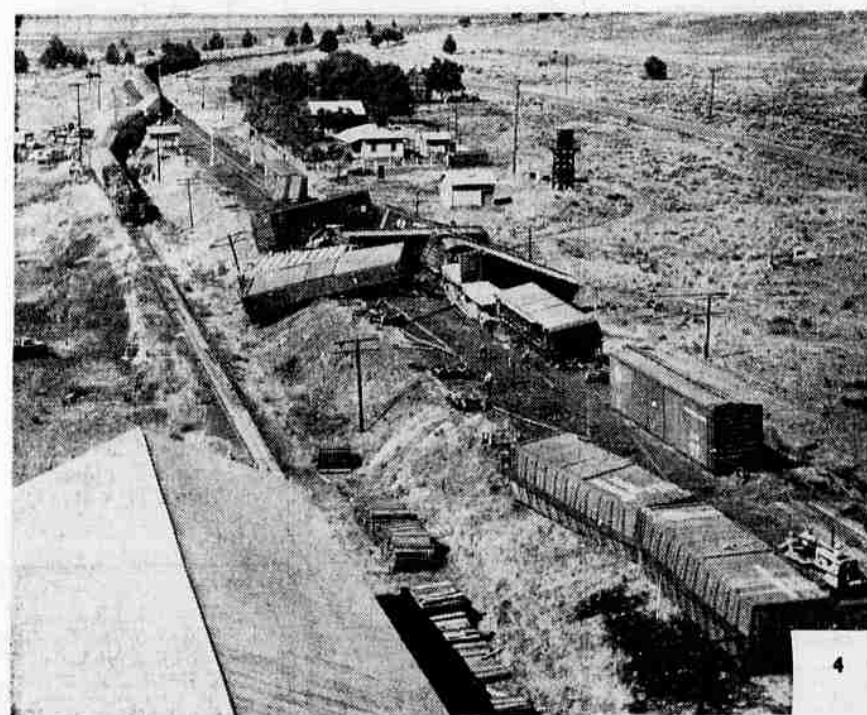
1.— PAYLESS DRUG suffered fire, smoke and water damage estimated between $250,000 and $300,000 on Sunday, May 24. The alarm was turned in at 3:29 a.m. 2.— DICK B. MILLER Company building, Seventh and Klamath, was completely wrecked inside by fire on Thursday, May 14. Loss was estimated in excess of $100,000. The alarm was sounded at 10:47 p.m. 3.— MCCOLLUM LUMBER COMPANY , South Sixth and East Main, was razed by flames Monday, June 29. Loss was between $100,000 and $200,000. The alarm was sounded at 2:13 a.m. by Leslie Herrick. 4.— FREIGHT TRAIN derailment at Worden on Friday, July 3, dumped 21 cars into a jumbled mass. Considerable damage was incurred, but no injuries. It was speculated a hot journal box may have caused it. 5.— THE FIRST F-101's arrived at Kingsley Field on Thursday, May 28. The first plane touched down at 10:15 a.m., marking the transition from F86 Sabrejets to the Voodoos. Kingsley Field was declared operational on April 1. 6.— THE NEW JOHNS-MANVILLE plant, north of Klamath Falls, was officially opened on Tuesday, June 30. Here, Governor Mark Hatfield, left, Herald and News Publisher Frank Jenkins, center, and Johns-Manville President A. R. Fisher are shown at the dedication ceremonies for the plant. 7.— CHILOQUIN FIRE broke out September 10, cutting a swath about two miles wide through 14,000 acres of timber. The fire claimed the life of Clifford Daw, 32, State Highway employe. Here, the fire crowns in a Ponderosa pine near the Williamson River. 8.— WEST SIDE BYPASS was officially opened for traffic on Friday, November 20. Here, Mayor Lawrence Slater snipped the ribbon at the north entrance. Approximate cost of the route was $1,843,000. 9.— FINAL DAY of protests on taxes to County Board of Equalization found courthouse corridors crowded with protesters. More than 230 protests were received over reappraisal of property mainly in the Hot Springs Addition. 10.— TWO COUNTY OFFICIALS figured in the 1959 news. Charlie Mack, right, was appointed to the State Tax Commission on January 24. February 6, Commissioner Bob Walker was named County Judge and Frank Ganong, left, was appointed to the county court as a commissioner. 11.— OPEN HOUSE for the public was held the week of July 20-25 as First Federal Savings and Loan completed extensive remodeling. It resulted in producing one of the most modern structures in the city.