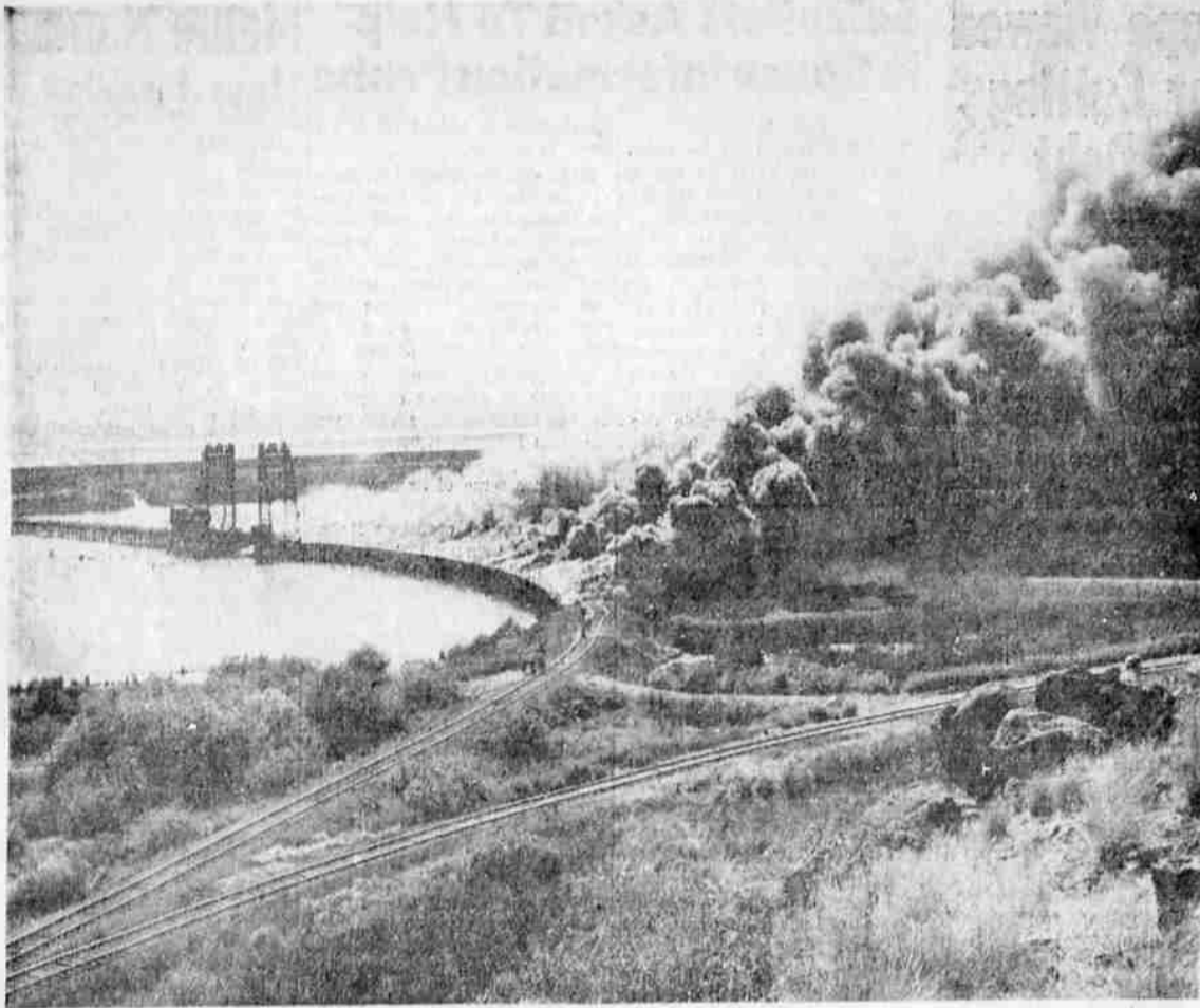
THE BRIDGE TRESTLE across Lake Ewauna of the Great Northern Railway burst into black smoke and was partially destroyed by flames on Thursday, July 16. The fire may have started in a wooden shed beneath the drawbridge. Loss was estimated between $75,000 and $100,000.