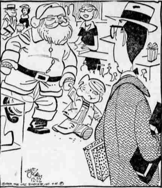
"DAD! I TALKED SANTA CLAUS INTO HAVIN' LUNCH WITH US!"