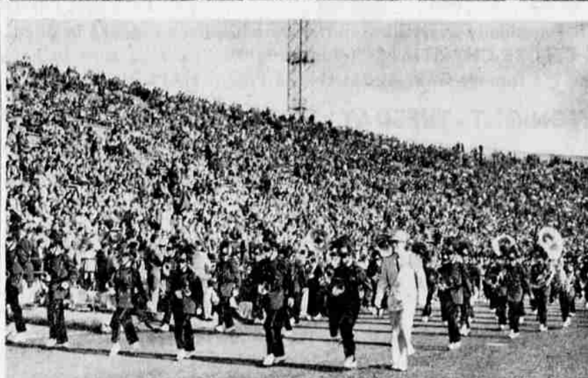
THE KUHS MARCHING BAND will leave late this week for the Shrine East-West football game in Kezar Stadium, San Francisco. They will perform in halftime pageantry on December 27.

Contributions to The Salvation Army Christmas Appeal assure a happier Christmas for many in our community — toys and parties for children, gaily-wrapped remembrances for the imprisoned, for the elderly, the shut-ins, and the sick, and Christmas dinners for the hungry.