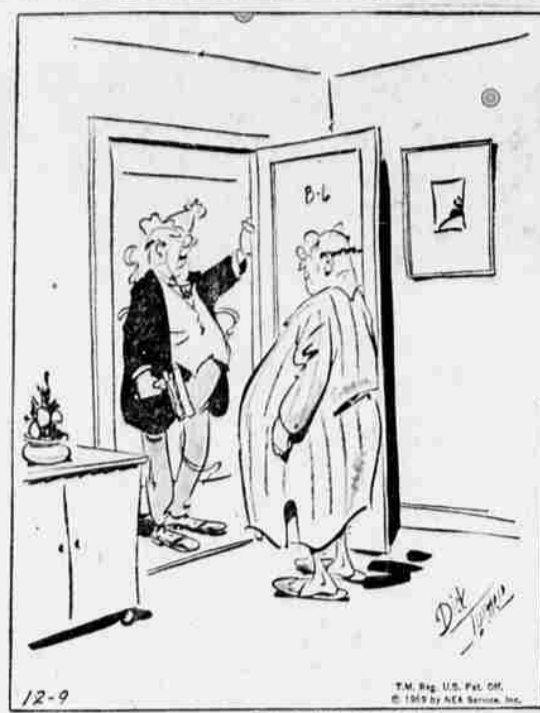
"Sorry I got you out of bed, Higgins. We became worried when you didn't come up to complain!"