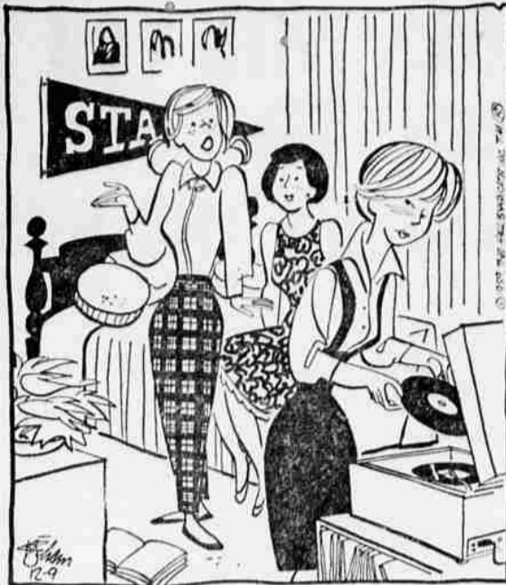
THAT'S PRETTY GRUESOME, BUT LET ME TELL YOU WHAT HE DID TO ME ONE NIGHT WHEN I WAS SITTING WITH HIM...

Annatto is a yellowish-red dye, stuff made from the pulp of the seeds of a tropical tree and used to color various foods.