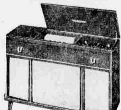
model SK24 CONSOLE 3 CHANNEL STEREO HI-FI

Golden Stereo "400" Automatic Record Changer, 7 mil and 3 mil sapphire styl, 34 watts total maximum peak power, 17 watts total maximum undistorted power output, 5 speakers, one 12", two 6 1/2", two 4". Angled round Sweep Panels. In grained Mahogany, Blued or Walnut colors. 20 1/2" high, 44" wide, 16 1/2" deep.