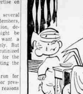
"I JUST WANTED TO TELL YOU I'M SORRY I GOT SO MAD. AN' I GOD BLESSED YA AFTER ALL."

ve-year term is up. "Are you kidding?" said he. A further chapter in a serie utlining the machinery of education in Klamath County will be featured in Monday's Herald and