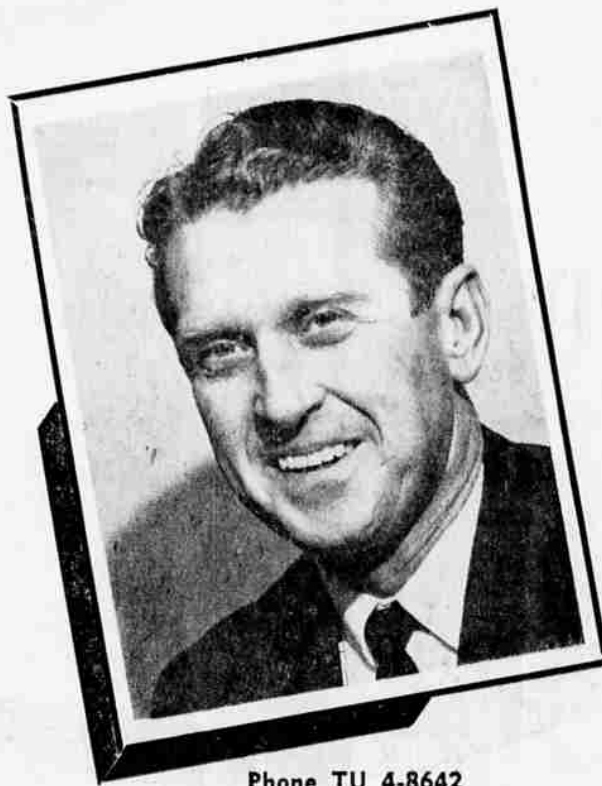
Phone TU 4-8642