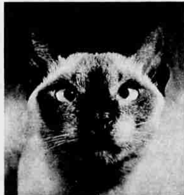
Although good conversationalists, some are hard to look straight in the eye.