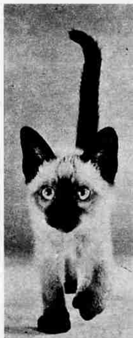
A well-marked Siamese looks as if he put snoot in soot.

They're pure white at birth and sometimes cross-eyed. But as their colors come and they begin flexing their muscles—and voices—they turn into what one author has called "the gayest thing on earth."