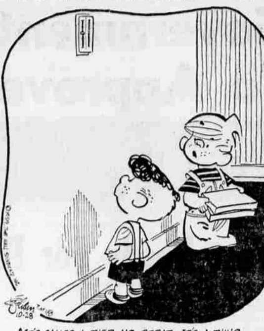
"IT'S CALLED A THER-MO-STRAT. IT'S A THING MOM PUSHES UP AND DAD PUSHES DOWN!"