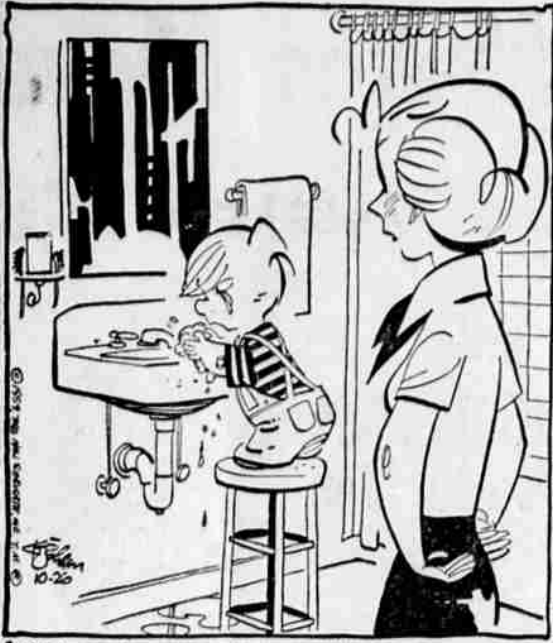
"WASH, WASH, WASH! DAY 'N' NIGHT! WASH, WASH, WASH!...."